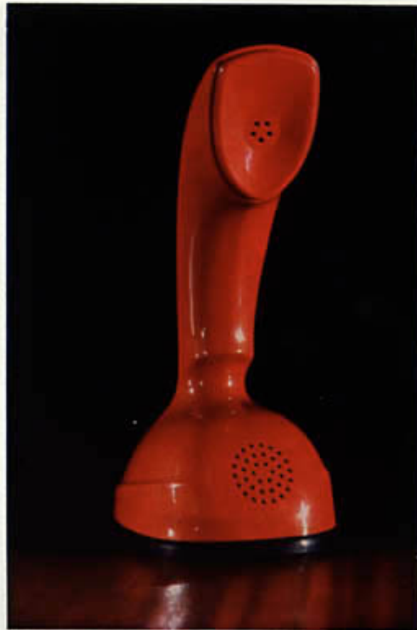
Fig. 4 The Ericofon is made in several colours

The base is designed to enclose the various components and at the same time fit the hand naturally. At the juncture of base and neck there is a rounded depression in the front face (fig. 5) which serves as a thumb grip. When the thumb of the left hand is placed here, the palm lies against the slightly curved rear of the base and the fingertips against the side, as seen in fig. 6. The conspicuous thumb grip tends to indicate to the new user of the Ericofon that the set should be grasped around the base and not at the neck, like an ordinary handset. The Ericofon may, of course, be held in this way if desired, but the lower grip is much more convenient. After thorough experimentation and study of various types of hands, a form was arrived at which fits a large male hand and a small female hand equally well.