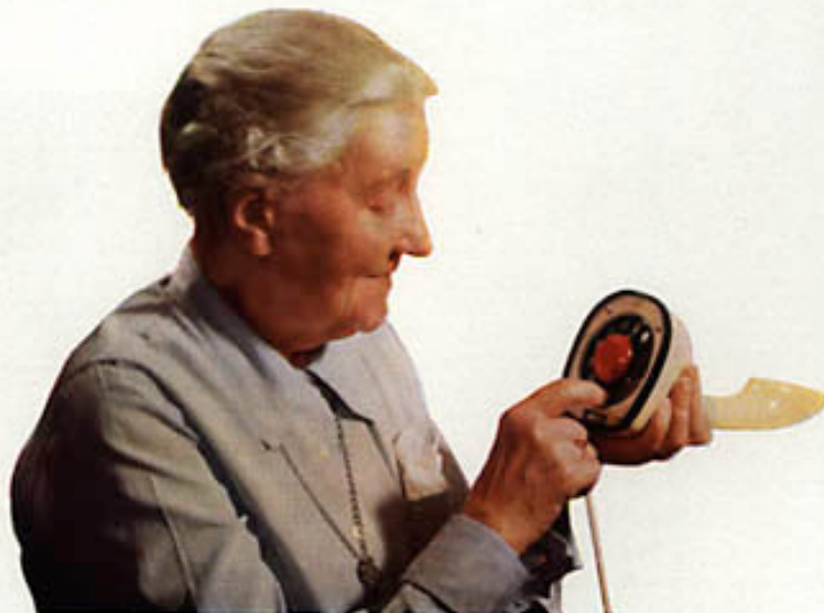
Fig. 12 The caller instinctively holds the dial at the distance best suited to the eye

For subscribers, the main value is the extreme convenience in handling the Ericofon. The placing of the dial in the handset simplifies its use in practically every situation, as proved by several years of trials with a large number of Ericofons. The dial, so to speak, comes straight into the subscriber's hand,