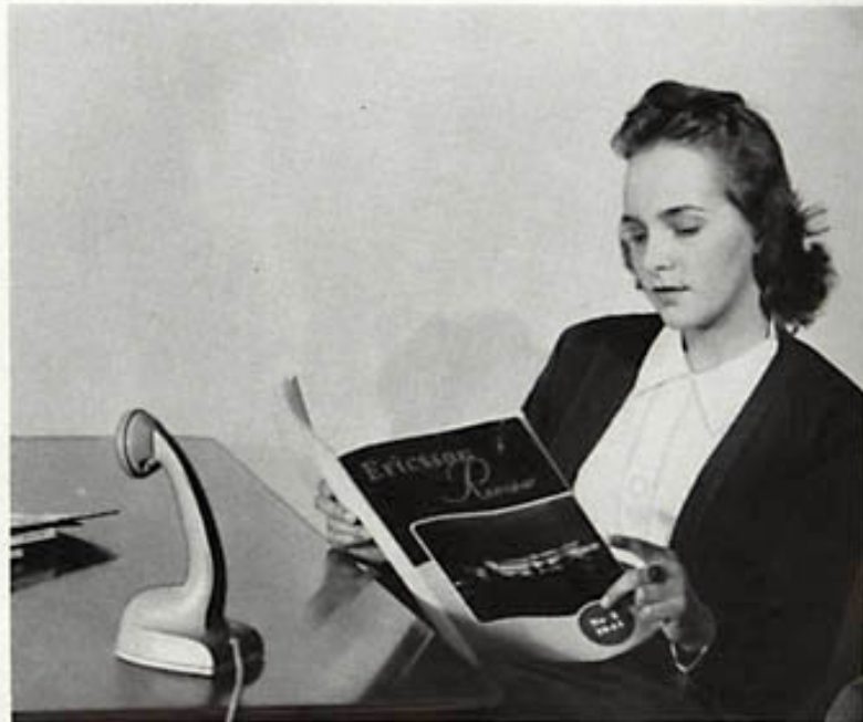
Fig. 2 The first working model

Some clay models, early versions of this design, are shown in fig. 1. The first model used in actual telephoning is shown in fig. 2. After many years of experimentation and practical tests the new telephone set—the Ericofon —can now be presented.