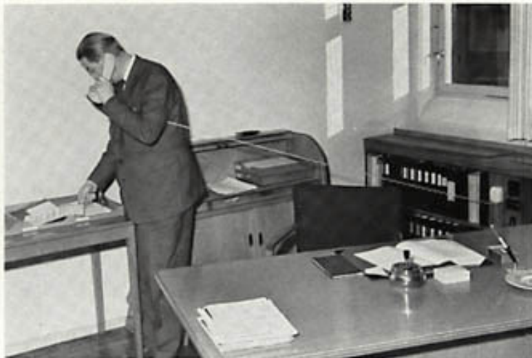
Fig. 11 X 8004 The coiled cord allows wide freedom of movement

user great freedom of movement. The remainder of the cord is straight, so as not to catch on the edge of the desk. It enters between the plastic case and the bottom frame and connects directly to terminals on the springset. The cord has only three conductors, a result of the newly developed circuit design of the Ericofon described in a separate article.