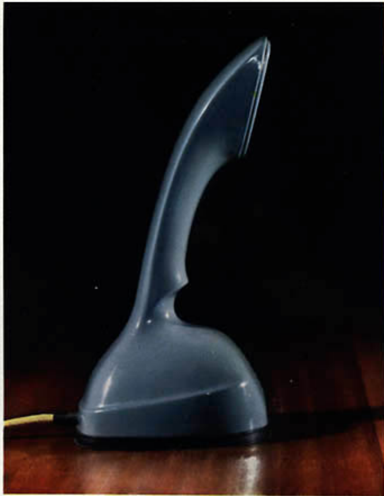
Fig. 3 The characteristic lines of the Ericofon