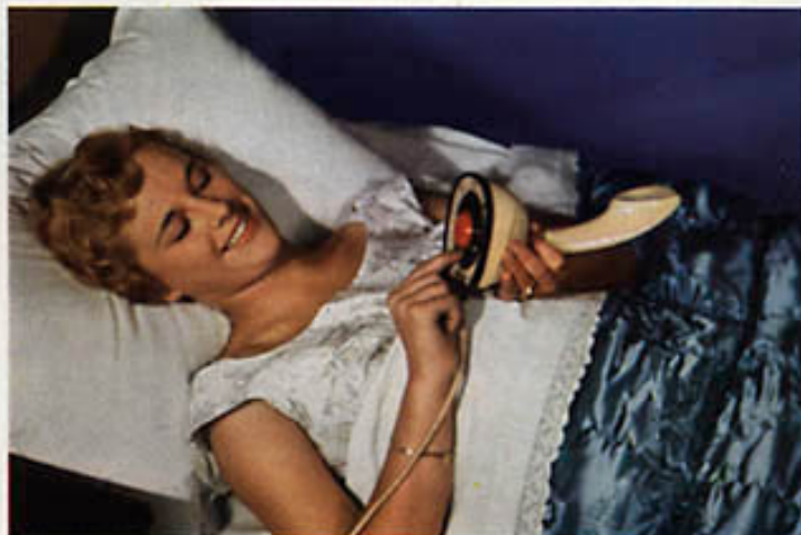
Fig. 13 Even in bed, you can easily use the Ericofon—the telephone with the most accessible dial

For telephone companies the most valuable feature of the Ericofon, in addition to its good transmission characteristics, is the likelihood of its proving extremely reliable and involving minimum maintenance costs. This is assured by the general simplicity of construction, with the one-piece, easily removed, plastic case containing receiver and transmitter; by the chassis for the remaining components which has a minimum of soldered connections and which, when the case is removed, lies open for inspection and service; by the single cord; and, finally, by Ericsson's high-quality components and parts. The small weight and dimensions of the Ericofon make for simpler and cheaper transport and storage. The wide choice of colours and the ease of changing the case makes it possible to offer this service feature without great expense and without maintaining a large stock of spare parts.