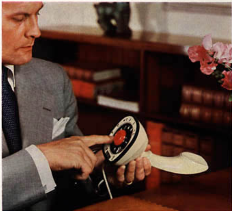
Fig. 6 The dial comes straight to you, makes dialling simple and sure

placed on the table, and switches the instrument from speaking to signalling condition. The button is made of nylon, it is of large diameter, it slides easily over irregular surfaces, and it does not mark the top of a table or desk. Being coloured red, it stands out clearly from the finger wheel, and accidental contact is therefore unlikely.